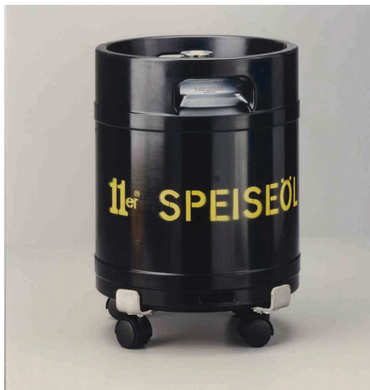
33L PU coated stainless steel container on trolley

A packaging system that stands the test of time