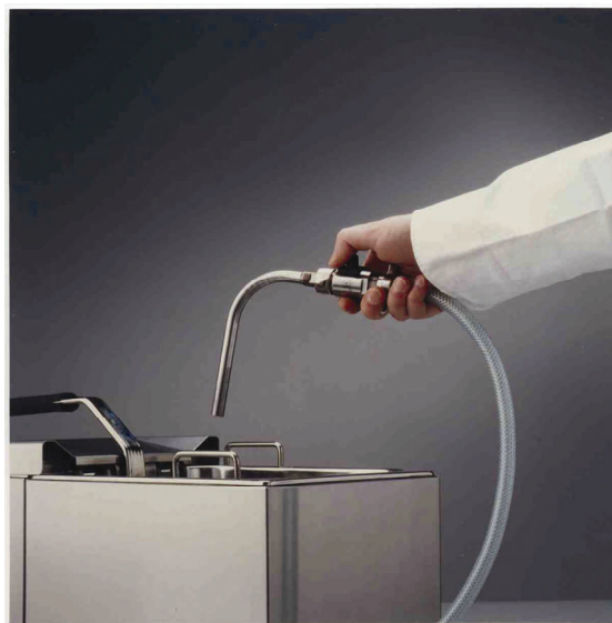
Dispense of frying oil to deep-fat fryer