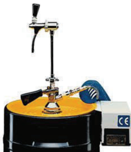
Dispense tap and compressor