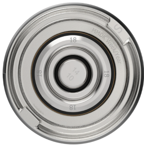
Unique color and year coding for preventive maintenance

The Micro Matic S-system is a security well type design with double valve operation. The spear has been improved with a unique color and year coding for preventive maintenance and hygiene properties have been optimized.