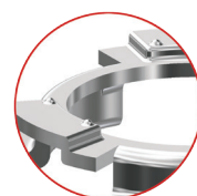
Retaining disc Hygiene optimization